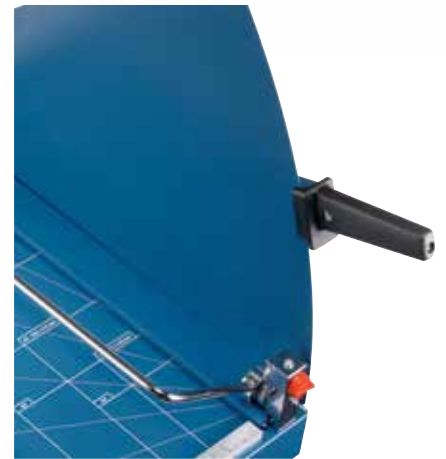
Metal guard plate for reassuring safety while cutting