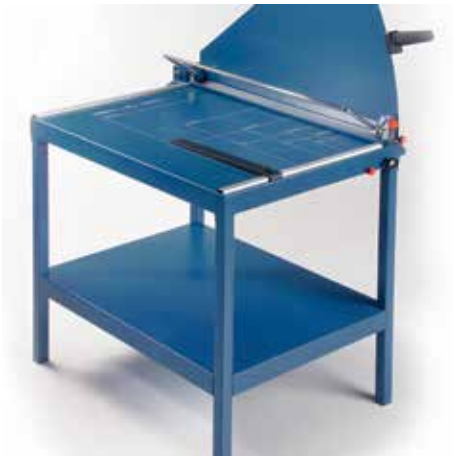
Sturdy stand for optimum working height available as accessory for models 519, 569, 589, 599