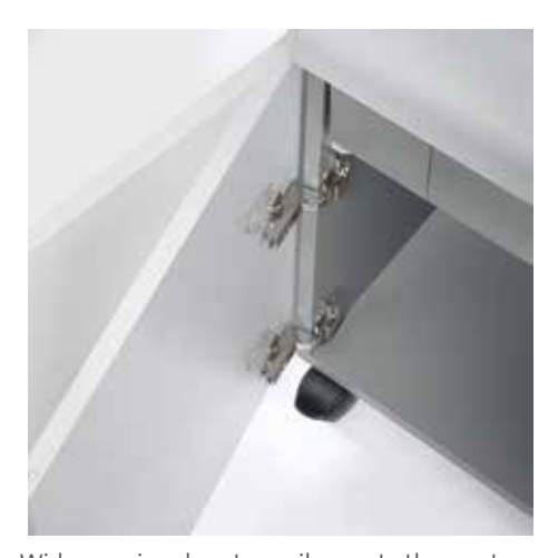
Wide opening door to easily empty the waste bag