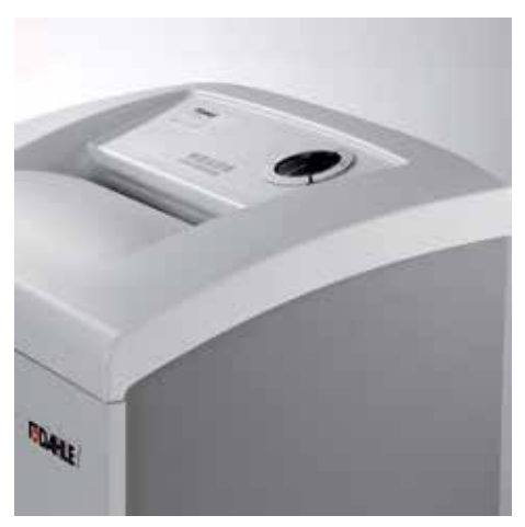
Modern design blends into any working environment.