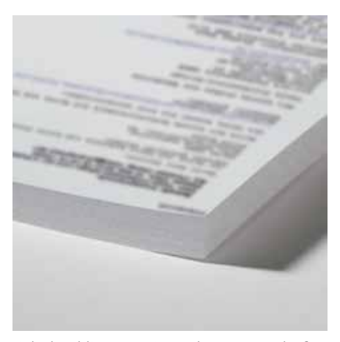
High shredding capacity makes easy work of shredding larger quantities of paper in one go