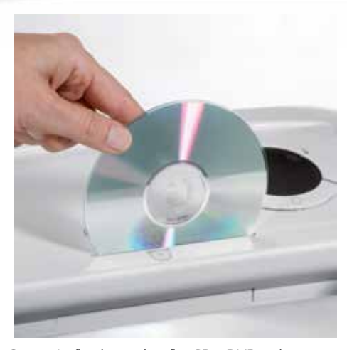
Separate feed opening for CDs, DVDs, cheque and credit cards guarantees reliable shredding of optical, magnetic and/or electronic data carriers