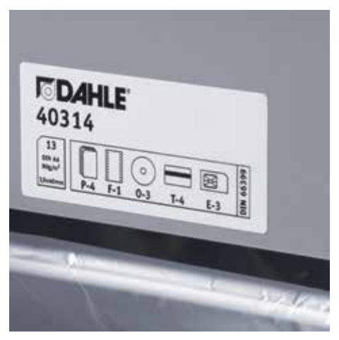
Clearly labelled performance characteristics on the top of the shredder help to ensure correct document shredder operation