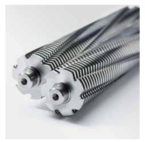
High-quality, solid-steel cutters in special steel for a guaranteed long service life