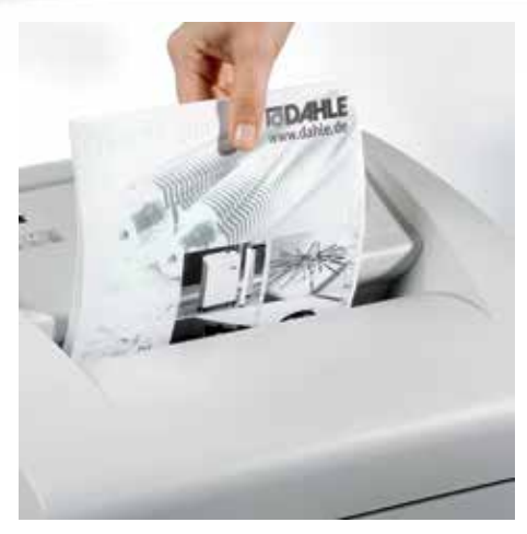
Standardised entry widths take all common paper sizes