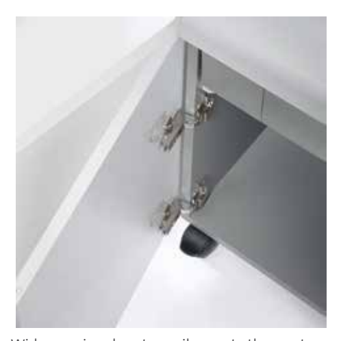
Wide opening door to easily empty the waste bag