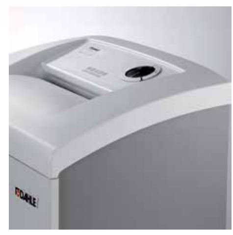
Modern design blends into any working environment.