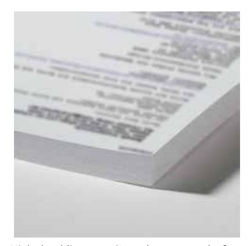
High shredding capacity makes easy work of shredding larger quantities of paper in one go