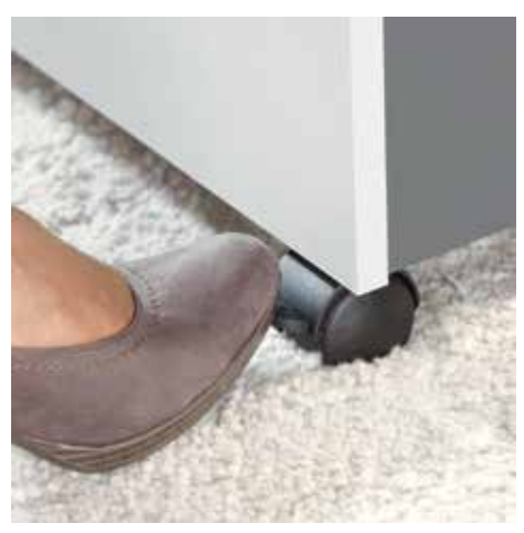
Convenient swivel casters providing 5 cm floor clearance for greater mobility and two brakes for reliably keeping the shredder firmly in place at the point of use