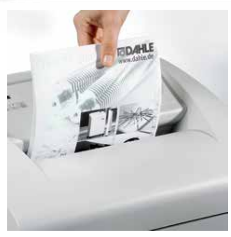
Standardised entry widths take all common paper sizes