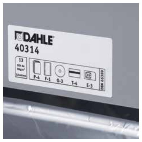
Clearly labelled performance characteristics on the top of the shredder help to ensure correct document shredder operation