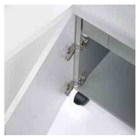
Wide opening door to easily empty the waste bag