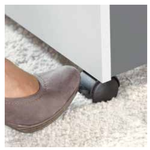
Convenient swivel casters providing 5 cm floor clearance for greater mobility and two brakes for reliably keeping the shredder firmly in place at the point of use