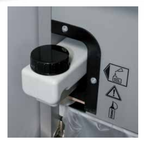
Integrated oil tank for controlled, automatic lubrication of the cross-cut cutters helps to lengthen service life while keeping performance constant