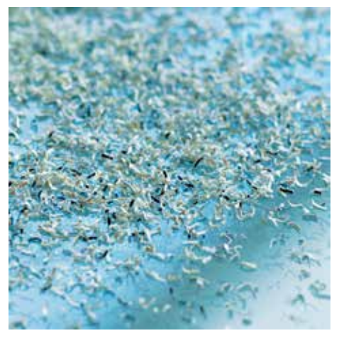
P-7 security: recommended for data media containing top secret data demanding maximum security measures