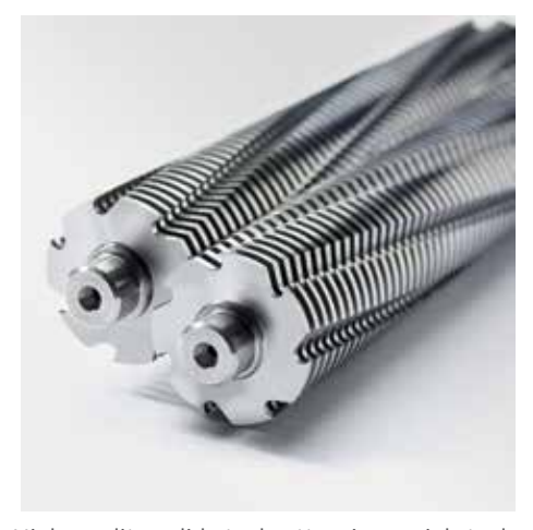
High-quality, solid-steel cutters in special steel for a guaranteed long service life