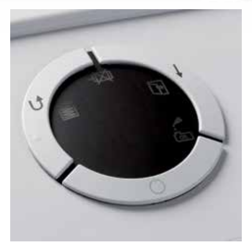
Clearly designed, user-friendly control panel permits easy, self-explanatory operation with illuminated symbols and acoustic signals