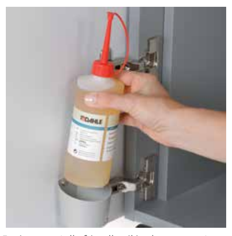
Environmentally friendly oil is always easy to access, included with all cross-cut models