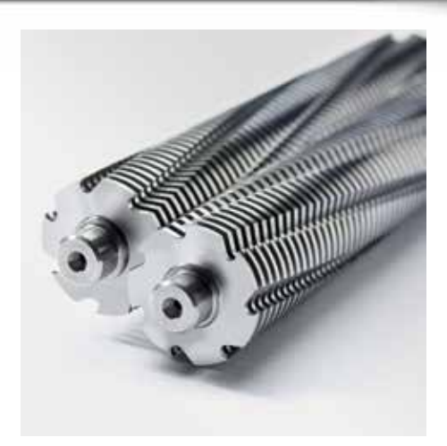
High-quality, solid-steel cutters in special steel for a guaranteed long service life