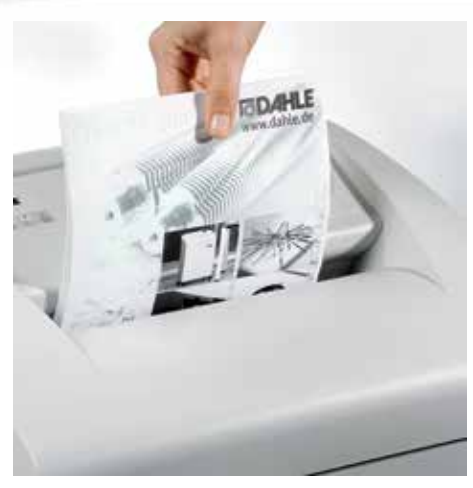
Standardised entry widths take all common paper sizes