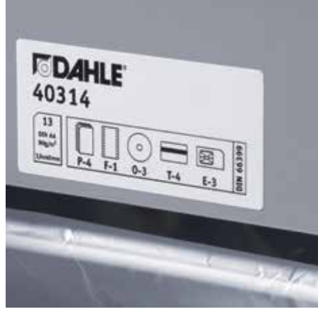
Clearly labelled performance characteristics on the top of the shredder help to ensure correct document shredder operation