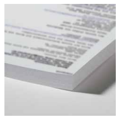
High shredding capacity makes easy work of shredding larger quantities of paper in one go

Pull-out rounded top frame that's kind on the fingers when changing the waste bag