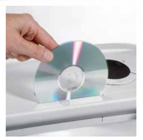
Separate feed opening for CDs, DVDs, cheque and credit cards guarantees reliable shredding of optical, magnetic and/or electronic data carriers