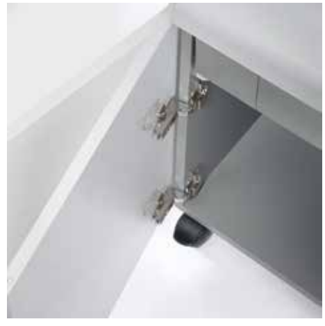
Wide opening door to easily empty the waste bag