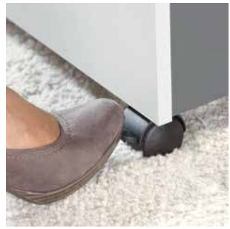
Convenient swivel casters providing 5 cm floor clearance for greater mobility and two brakes for reliably keeping the shredder firmly in place at the point of use