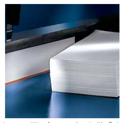
Large quantities of paper can be cut with effortless ease