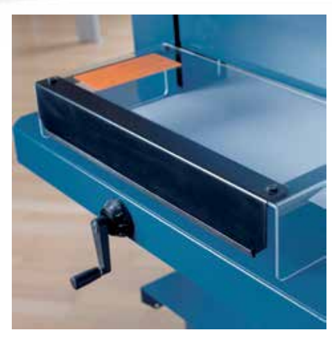
Transparent blade cover guards provide reassuring safety and unobstructed vision while cutting