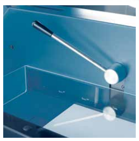
Convenient quick-action clamp for swift results