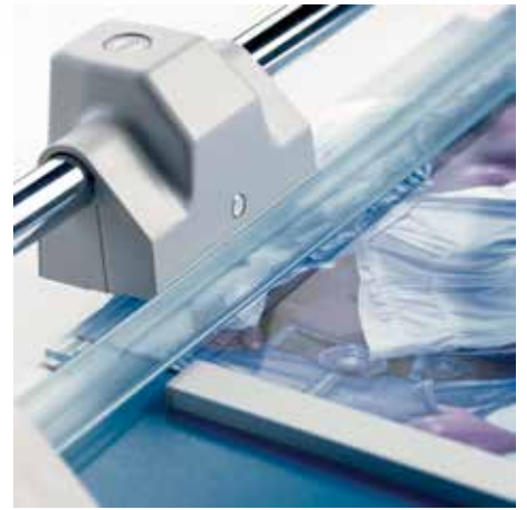
Automatic clamping on the cutting line for holding item being cut perfectly in place