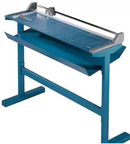
Sturdy stand with waste tray for optimum working height