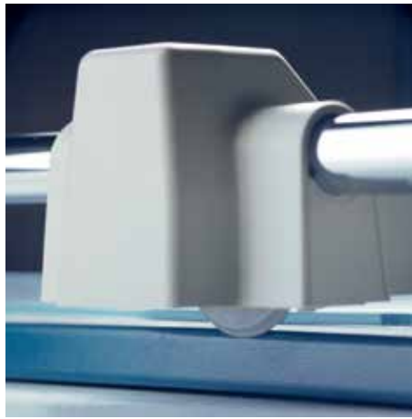
Circular blade enclosed in cutting head for safe and convenient operation