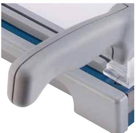
Ergonomically shaped handle to prevent tired hands while cutting