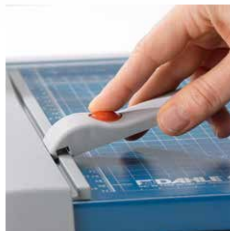
Adjustable backstop for quickly finding the right format can be used on both scale bars