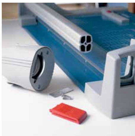
Easy-to-change cutting head to keep work processes running smoothly