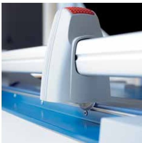
Circular blade in the sealed plastic housing provides maximum safety