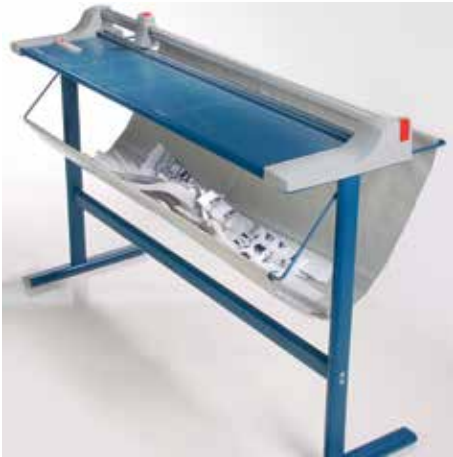
Sturdy stand with waste tray for optimum working height