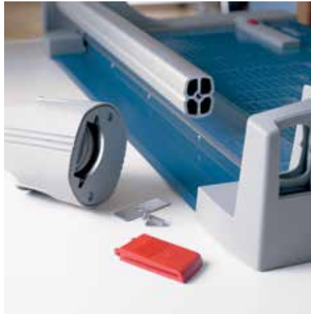
Easy-to-change cutting head to keep work processes running smoothly