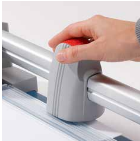
Ergonomic cutting head for convenient cutting-machine operation