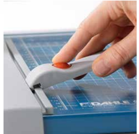
Adjustable backstop for quickly finding the right format can be used on both scale bars