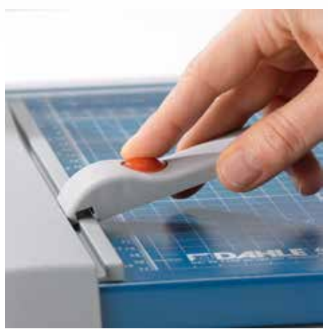
Adjustable backstop for quickly finding the right format can be used on both scale bars