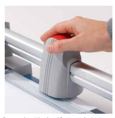
Ergonomic cutting head for convenient cutting-machine operation