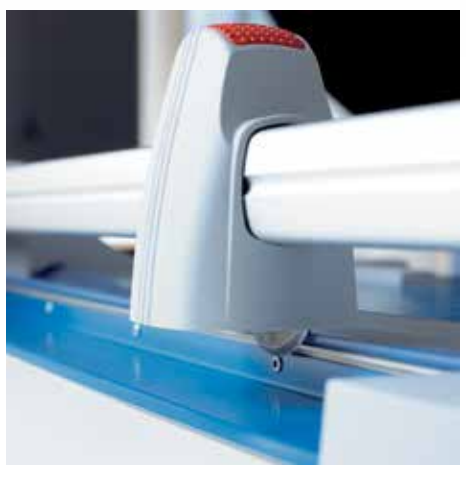
Circular blade in the sealed plastic housing provides maximum safety